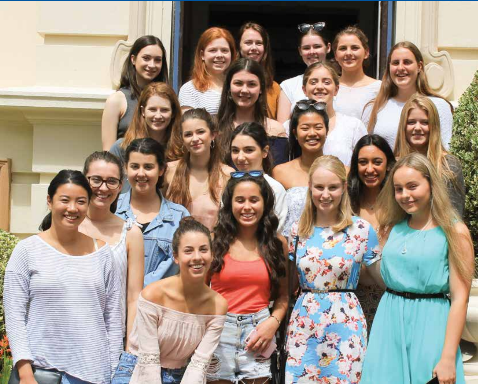
IB DIPLOMA STUDENTS CELEBRATING RESULTS, 4 JANUARY, 2017